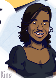
Yolanda Renée King