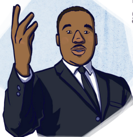
Martin Luther King